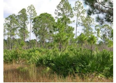
Alva Scrub Preserve

All preserves are open to the public for hiking, wildlife observation, and nature study. Several preserves offer additional recreation opportunities, including fishing, kayaking and canoeing, and horseback riding. Search recreation activities online or download recreation and amenities chart online.