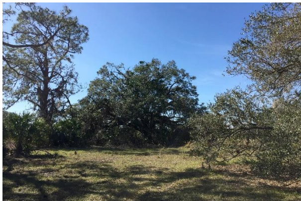
Olga Shores Preserve