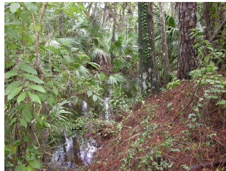
Daniel's Preserve at Spanish Creek

http://www.leegov.com/conservation2020/preserves