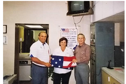
Alva School receiving a US flag in the 1980's

WoodmenLife has been awarded a rating of A+, the second highest ranking out of 15, for its financial strength and operating performance by A.M. Best.