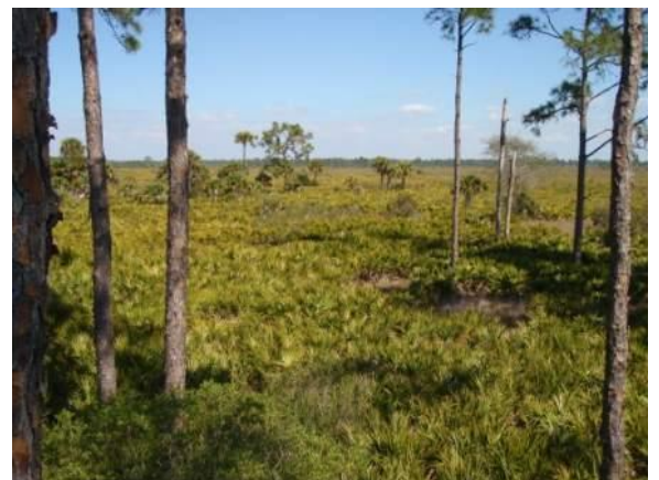
Telegraph Creek Preserve