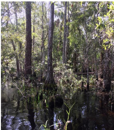
Bob Janes Preserve

Preserves are open daily during daylight hours. Access may be limited at certain locations due to temporary flooding, special restoration projects, or isolated location. Information about each Conservation 20/20 preserve can be accessed from the website: