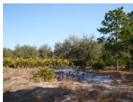
Buckingham Trails Preserve